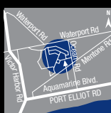
Hayborough THE RISE AT VICTOR Aquamarine Blvd 8554 2439