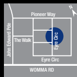
Penfield EYRE Eyre Crt 8284 8699