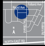
Northgate LIGHTSVIEW Rapid Ave 8266 3714