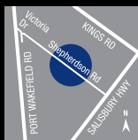
Parafield Gardens THE BOULEVARD Shepherdson Rd 8250 9281