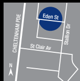
St Clair ST CLAIR Eden St NOW OPEN