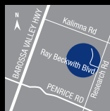
Nuriootpa BAROSSA ESTATE Ray Beckwith Blvd 8562 3730