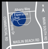
Seaford Rise COAST Esperance Blvd 8327 0622