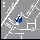
Evanston Gardens ORLEANA WATERS Sears Road NOW OPEN