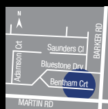
Mount Barker BLUESTONE ESTATE Bentham Crt 8391 0176