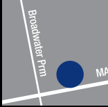
Blakeview BLAKES CROSSING Main Tce NOW OPEN

Finding a home you love is one of the great moments in life. Creating beautiful homes that people love is the best thing we do. Visit one of our inspiring display homes today to find out for yourself. We are open every Monday, Wednesday, Saturday and Sunday from 1pm to 5.30pm.