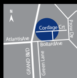
Seaford Meadows SOUTH Cordage Crt 8386 2408