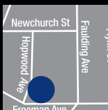
Munno Para West PLAYFORD ALIVE Hopwood Ave NOW OPEN