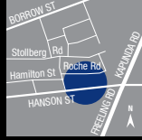
Freeling Hanson St 8525 2232